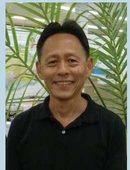
CH, you will be missed!