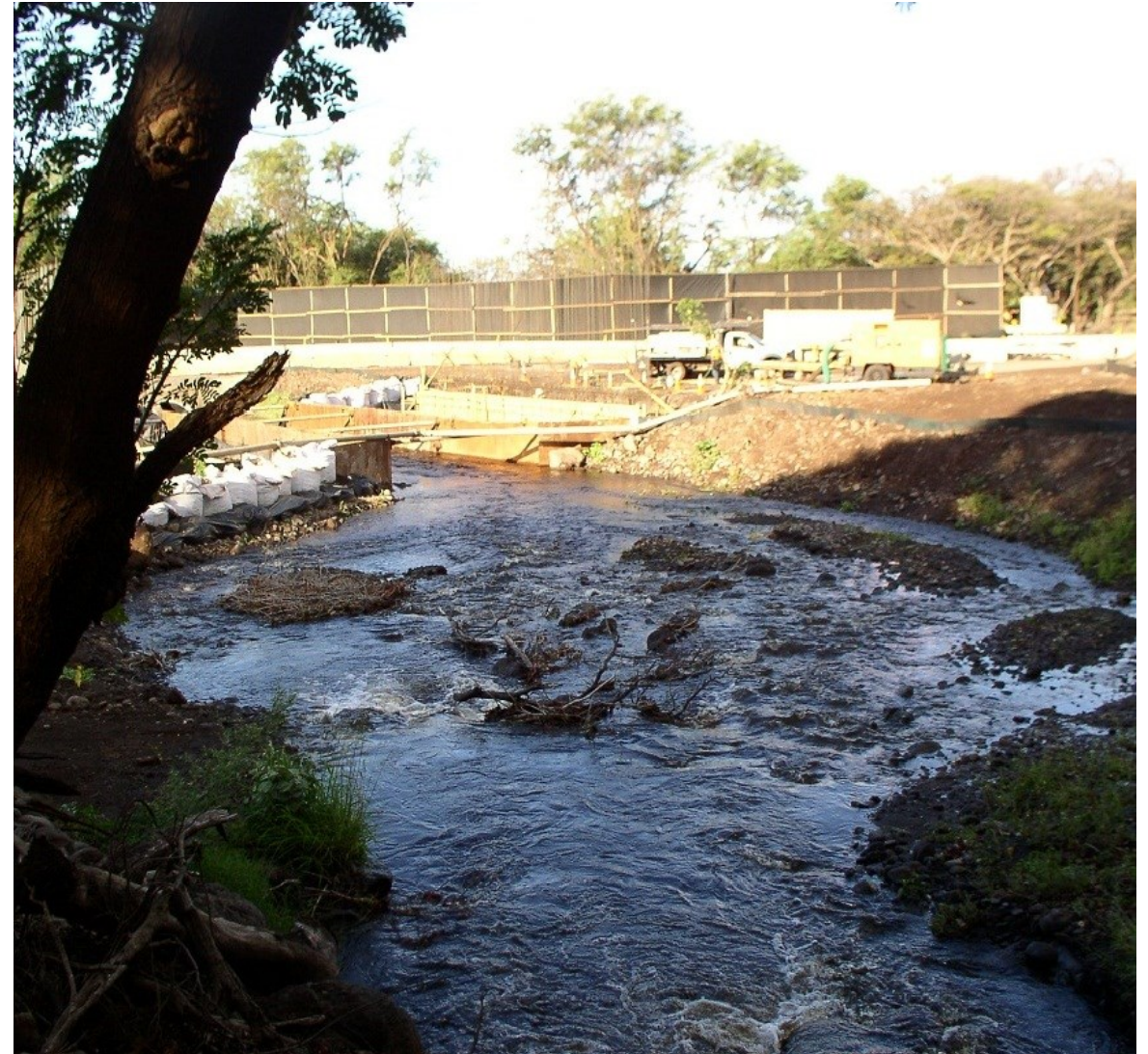
PHOTO: KAWELA BRIDGE CONSTRUCTION

KAWELA PLANTATION HOMEOWNERS ASSOCIATION P.O. Box 28 Kaunakakai, Molokai, HI 96748