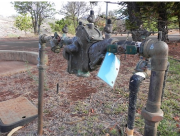
All lots with water in Kawela Plantation Homeowners Assn. have backflow preventers (BFPs). These BFPs are tested and repaired annually.

It is easy to protect your water supply from these hazards. Be aware of potential hazards and install appropriate backflow preventers at water outlets.